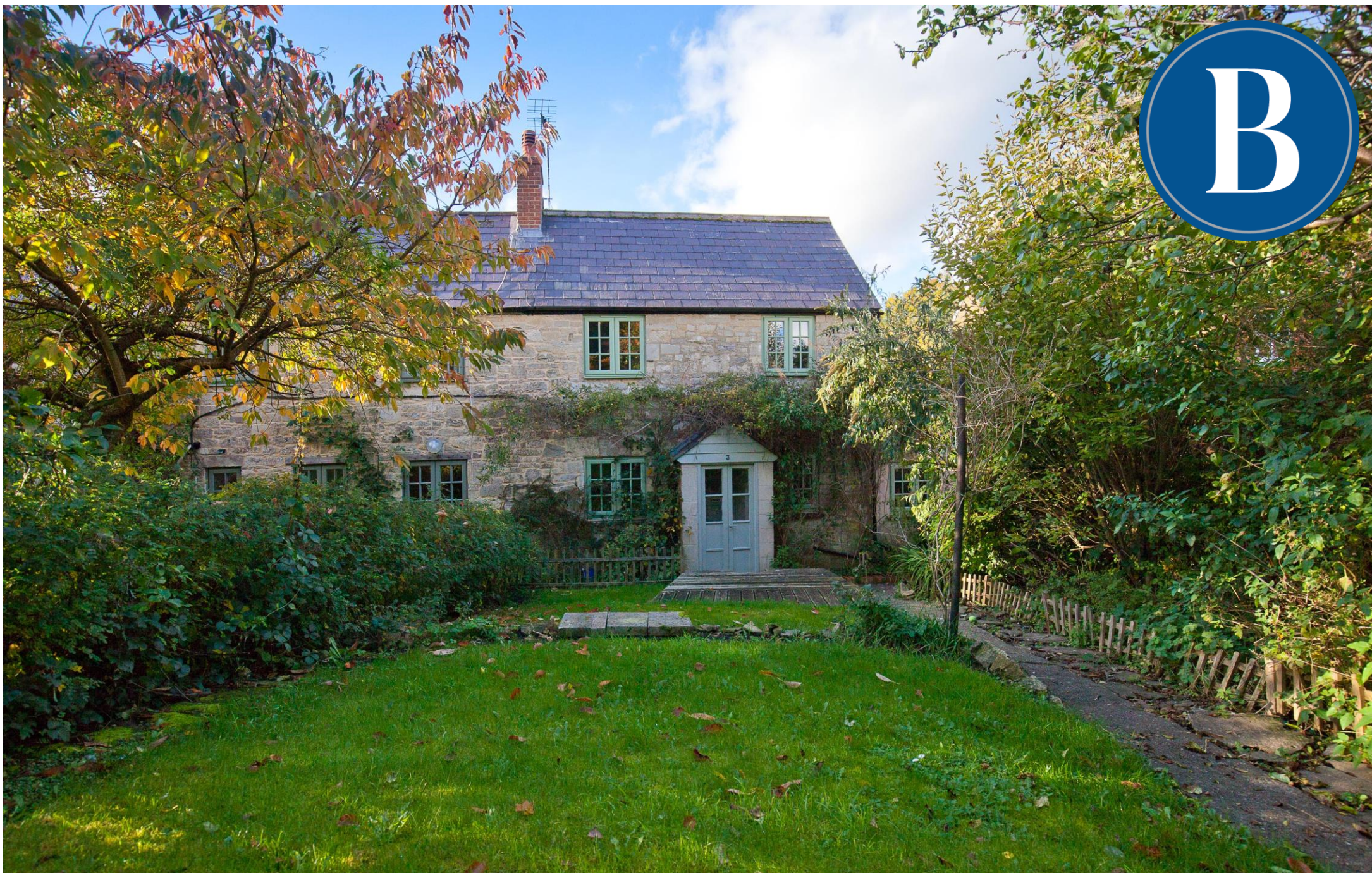
Alexandra Cottages, Tisbury